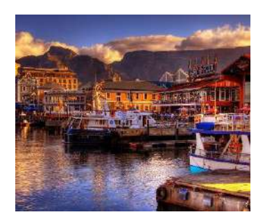
WERA World Congress, Cape Town, South Africa, August 2018