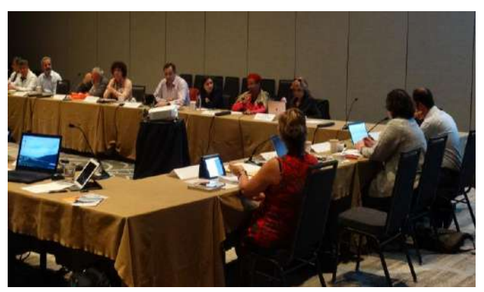
WERA Council Members at the Council Meeting in San Antonio, 2 May 2017

On May 2 2017, at the WERA Council Meeting in San Antonio, Texas, the WERA Council voted to advance an amendment to the WERA Constitution regarding membership. This action was taken by Council members, including alternate representatives attending for member associations.