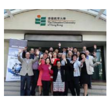
WERA Council Meeting, Hong Kong,3 December 2017