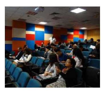
Doctoral and Early Career Network Meeting at WERA-HKERA, Hong Kong, 2017