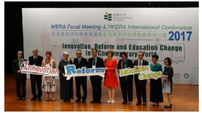
WERA Executive Committee members on the stage at the opening ceremony of the 2017 WERA Focal Meeting and HKERA International Conference.

The 2017 WERA Focal Meeting and HKERA (Hong Kong Education Research Association) International Conference took place from 30 November – 2 December 2017 at The Education University of Hong Kong (EdUHK), Hong Kong, followed by the WERA Council meeting took place on the 3<sup>rd</sup> of December 2017.